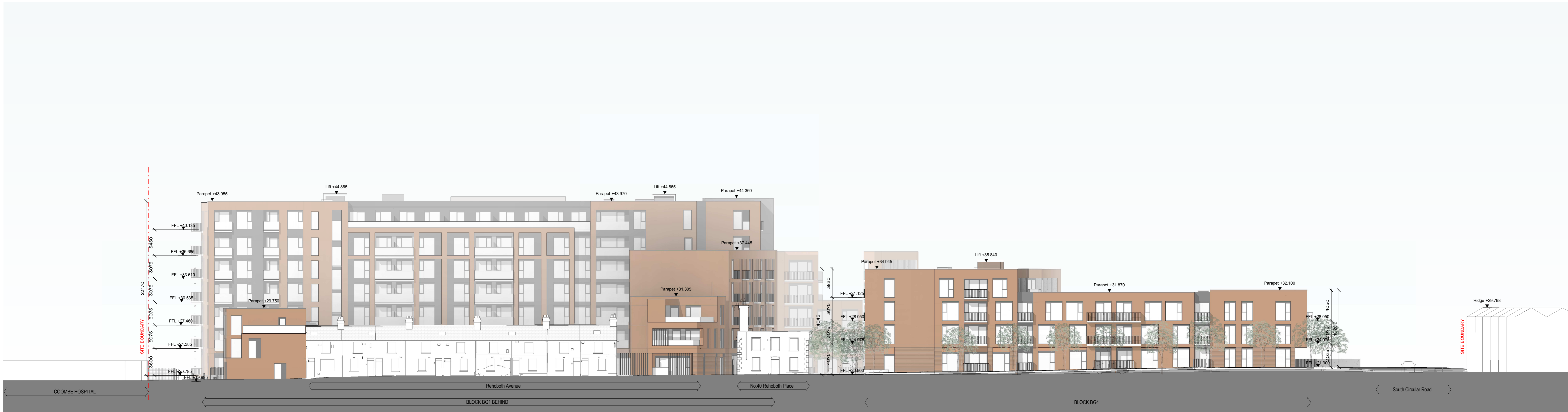
1 Contiguous Elevation 03 BG1-BG4 A 1:200